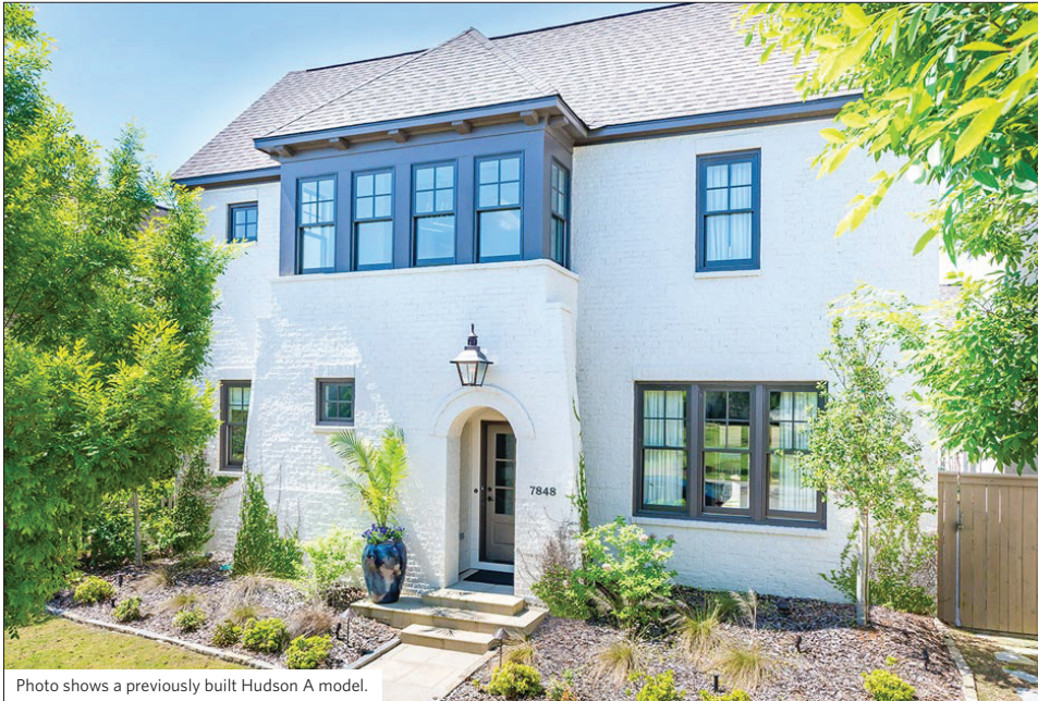
Photo shows a previously built Hudson A model.