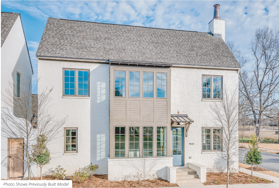
Photo Shows Previously Built Model