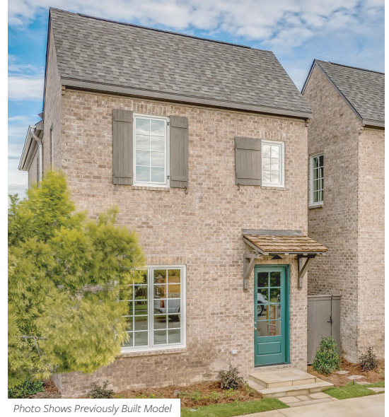
Photo Shows Previously Built Model