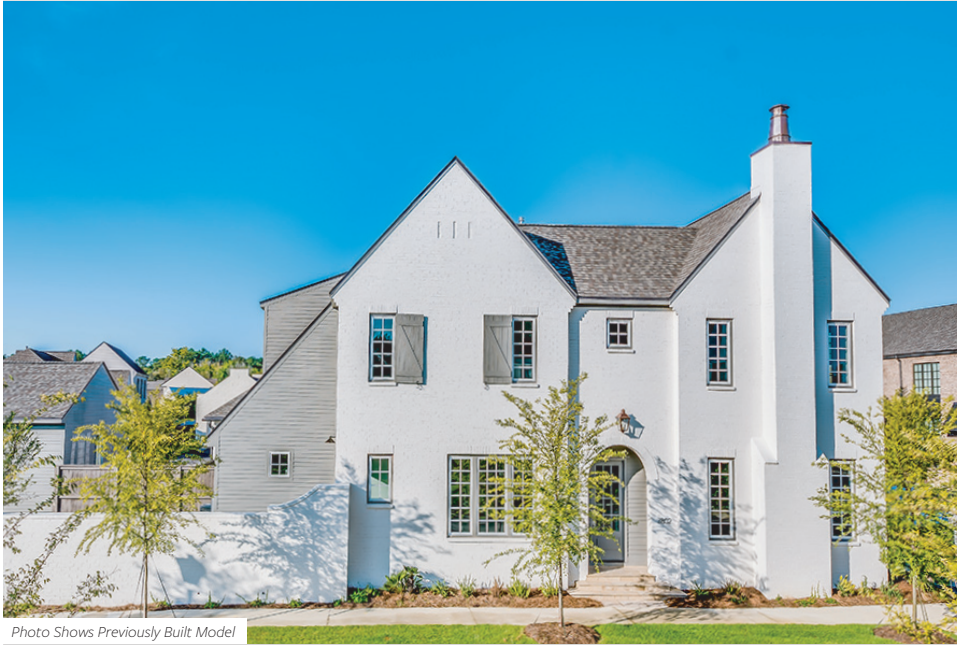
Photo Shows Previously Built Model