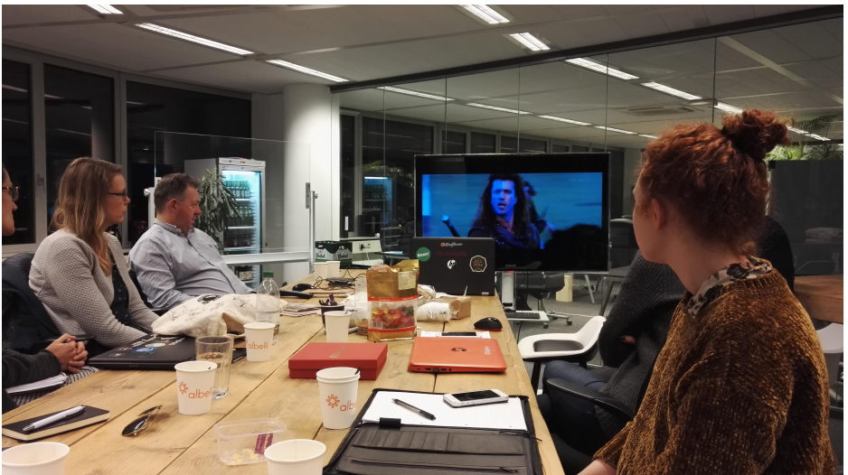
Off Site in Amsterdam, watching a motivational speech of Mel Gibson (Amsterdam - Spryng office)