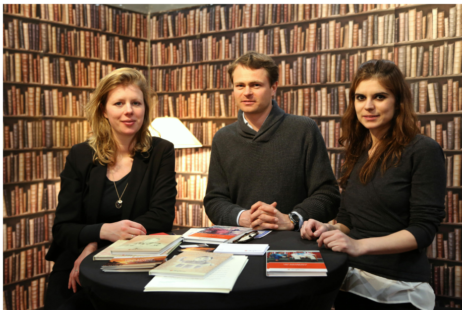
Second Home beurs 2015 (Utrecht)