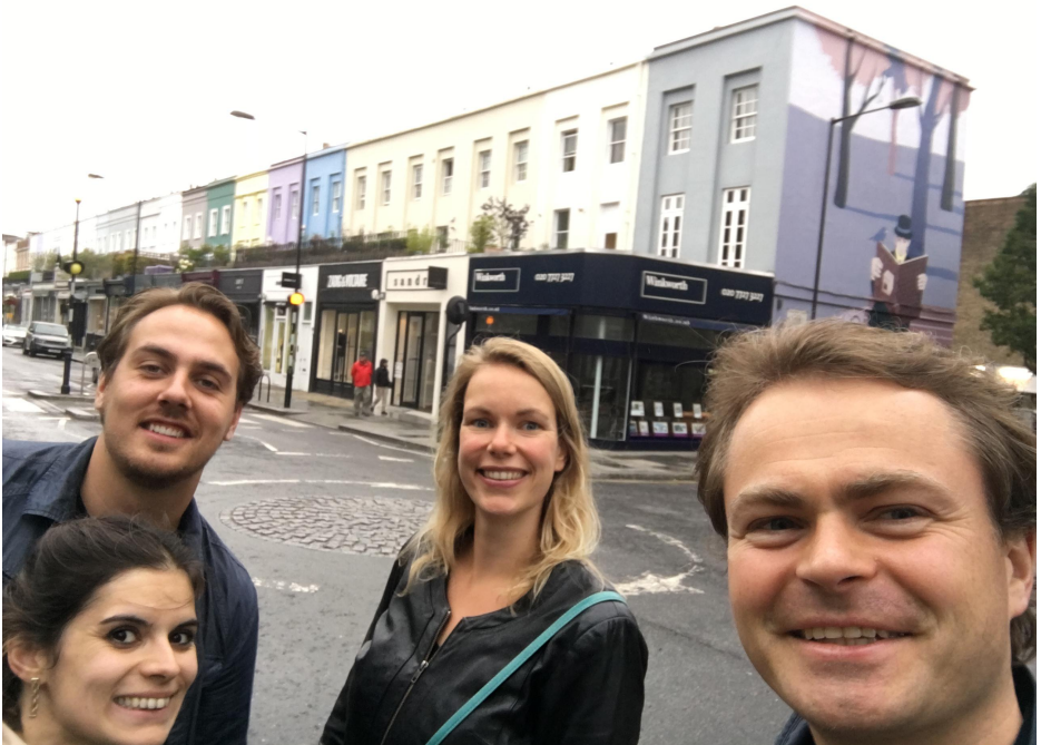
London visit for offsite