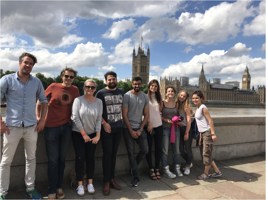
ST Offsite, August 2017 (London, UK)