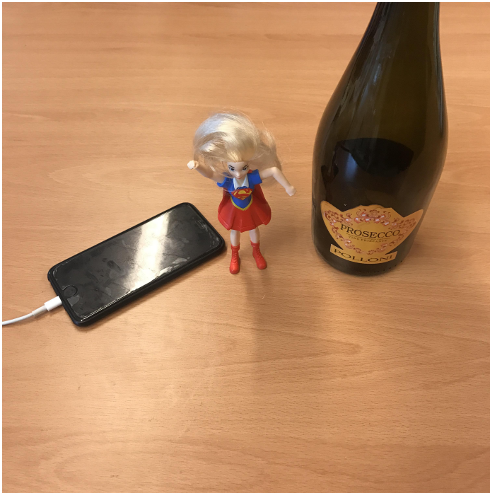
SuperOz - Another day at the office (Our office)