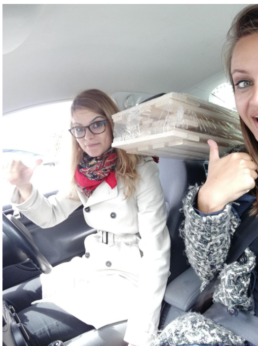
Fully loaded car (Oz' Beetle)