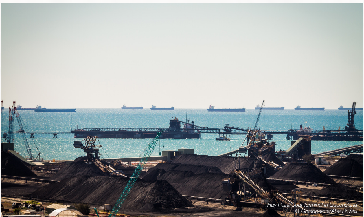
Hay Point Coal Terminal in Queensland