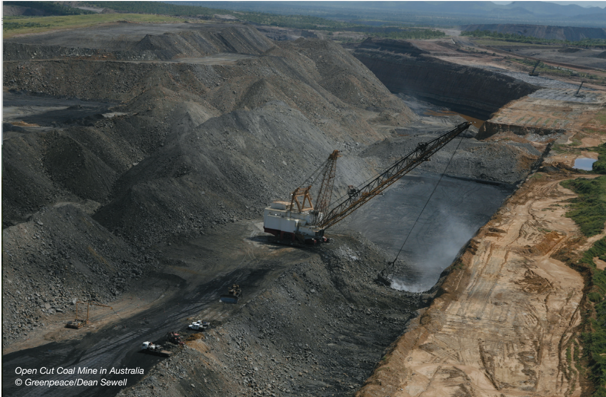
Open Cut Coal Mine in Australia

Santoro and Sciacca were both born in Sicily and are each prominent figures in the Australian-Italian community. Santoro has also held the role of president of the Italian Chamber of Commerce and Industry 105 , hosting many guests from the political, business and Italian community. 106 Santoro's Queensland Liberal faction included George Brandis, former Liberal Party member of the Australian Senate, leader of the government in the Senate during the Turnbull leadership period 2015-2017 and attorney-general of Australia during the Abbott-Turnbull leadership period from 2013-2017. 107