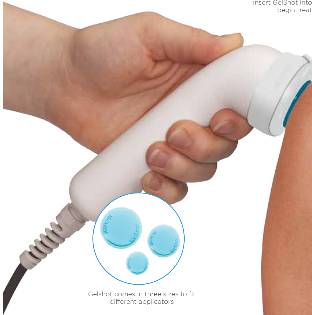
Gelshot comes in three sizes to fit different applicators