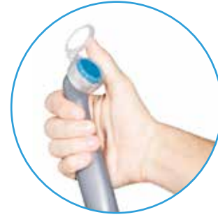
Easy to use application - Simply insert GelShot into adapter and begin treatment