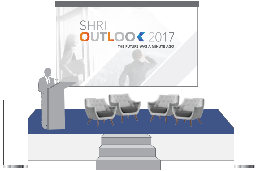
Stage Design (For illustration purpose only)