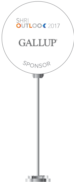
Table Tentcard (For Sponsors)