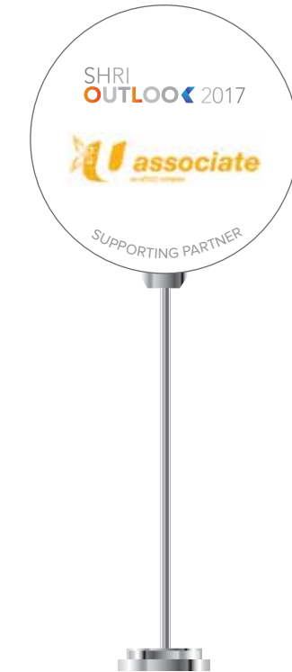
Table Tentcard (For Supporting Partners)