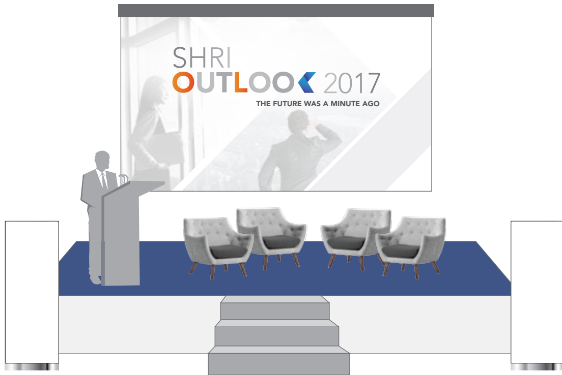
Stage Design (For illustration purpose only)