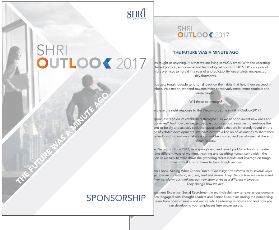
A5 Conference Brochure