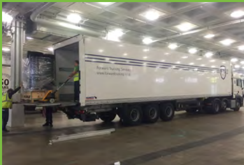
London Olympia For CAMRA