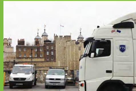
The Tower of London For The Classical Loo Company