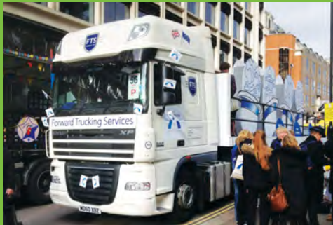
The Lord Mayor's Show The Opcyon Design Company