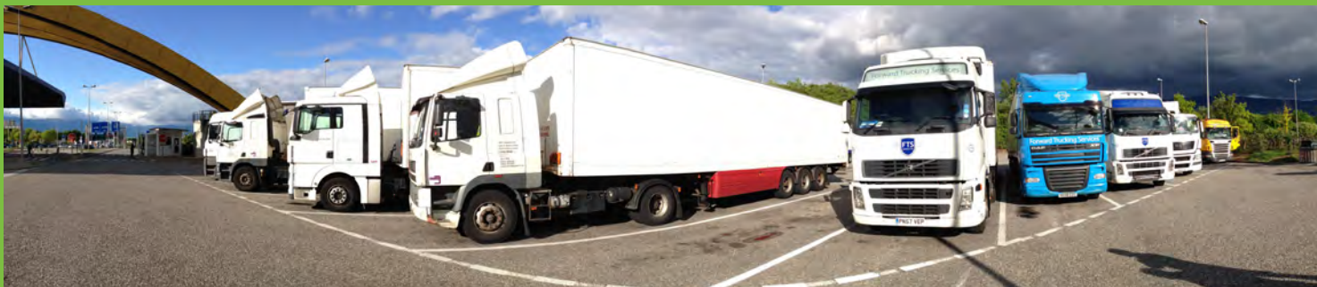
Border control, Switzerland for JMT inDisplay