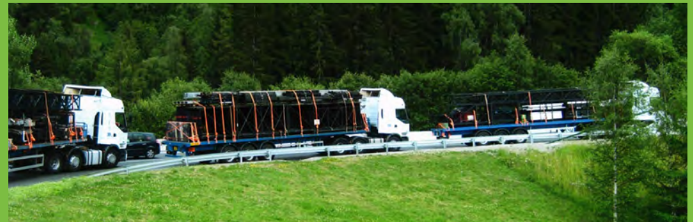
Madonna's Sweet and Sticky Tour 27 European Dates