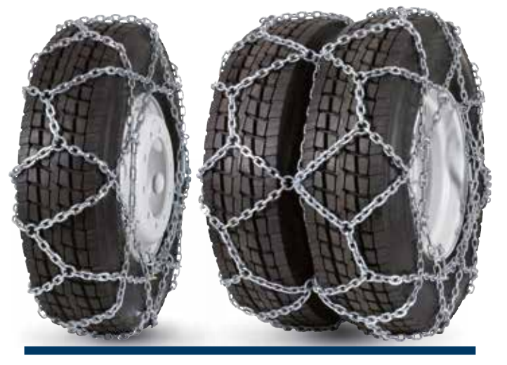
<sup>1)</sup> A - SV: Material strengths 5.6 to 8.2 mm Made in AT; Material strength 4.5 mm Made in CZ <sup>2)</sup> Applies to pewag austro super reinforced