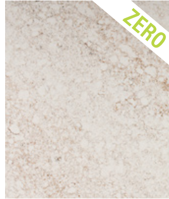
DESERT CEMENTO COMING SOON