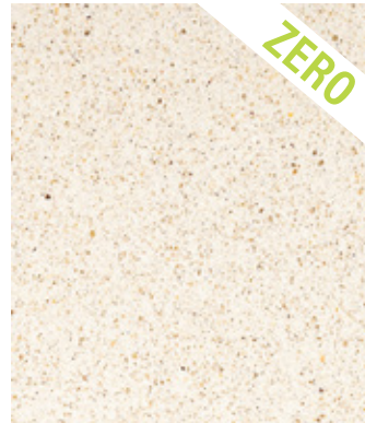
PALAMINO COMING SOON