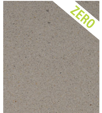
CONCRETE COMING SOON