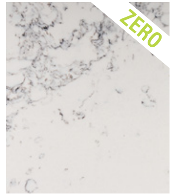
STATUMAX COMING SOON