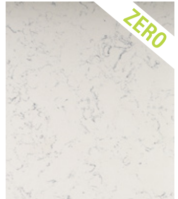
LYSKAMM COMING SOON