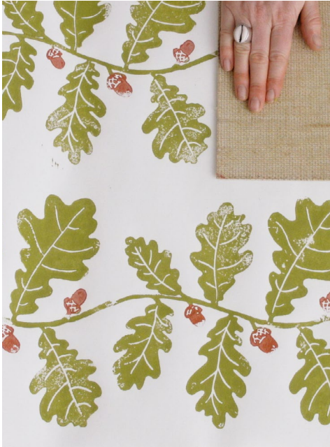
DECORATIVE ARTS & CRAFT