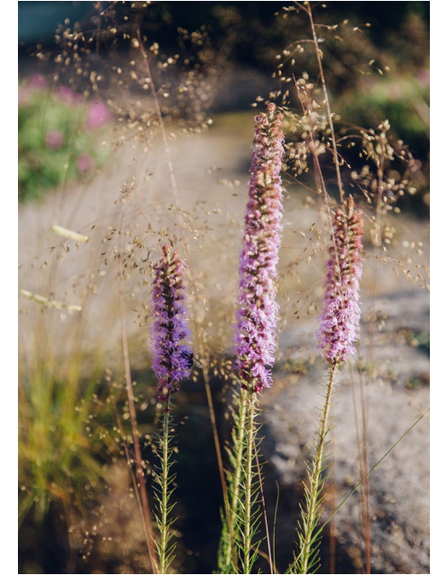
GARDENING & FLORISTRY

Beautiful video courses taught by industry leading experts in design, decorative arts, craft, gardening and food.