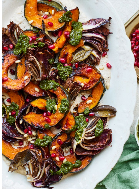
FOOD & DRINK