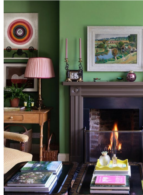
HOME & INTERIORS