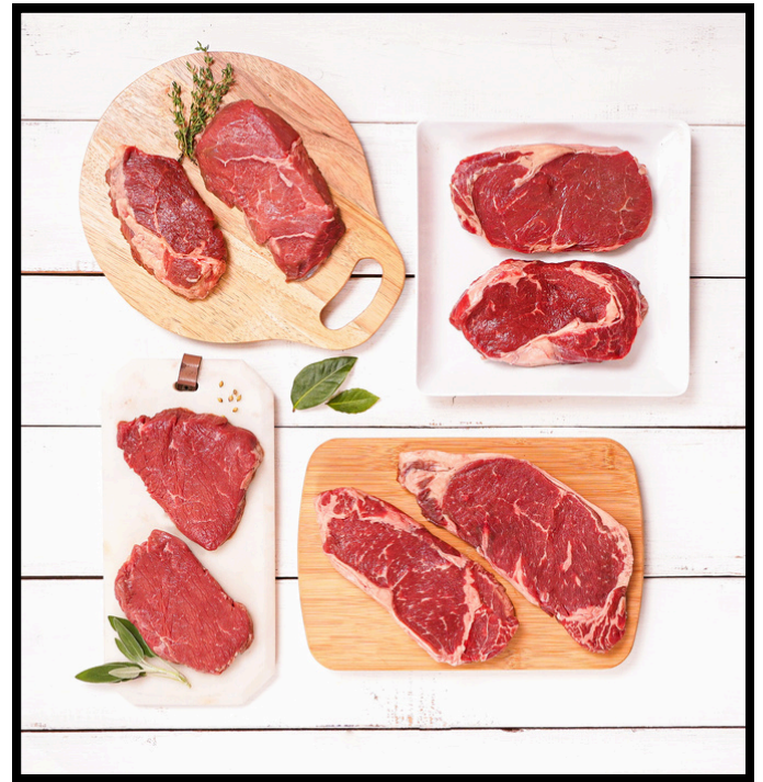
Steak Lovers Box 3 different sizes available