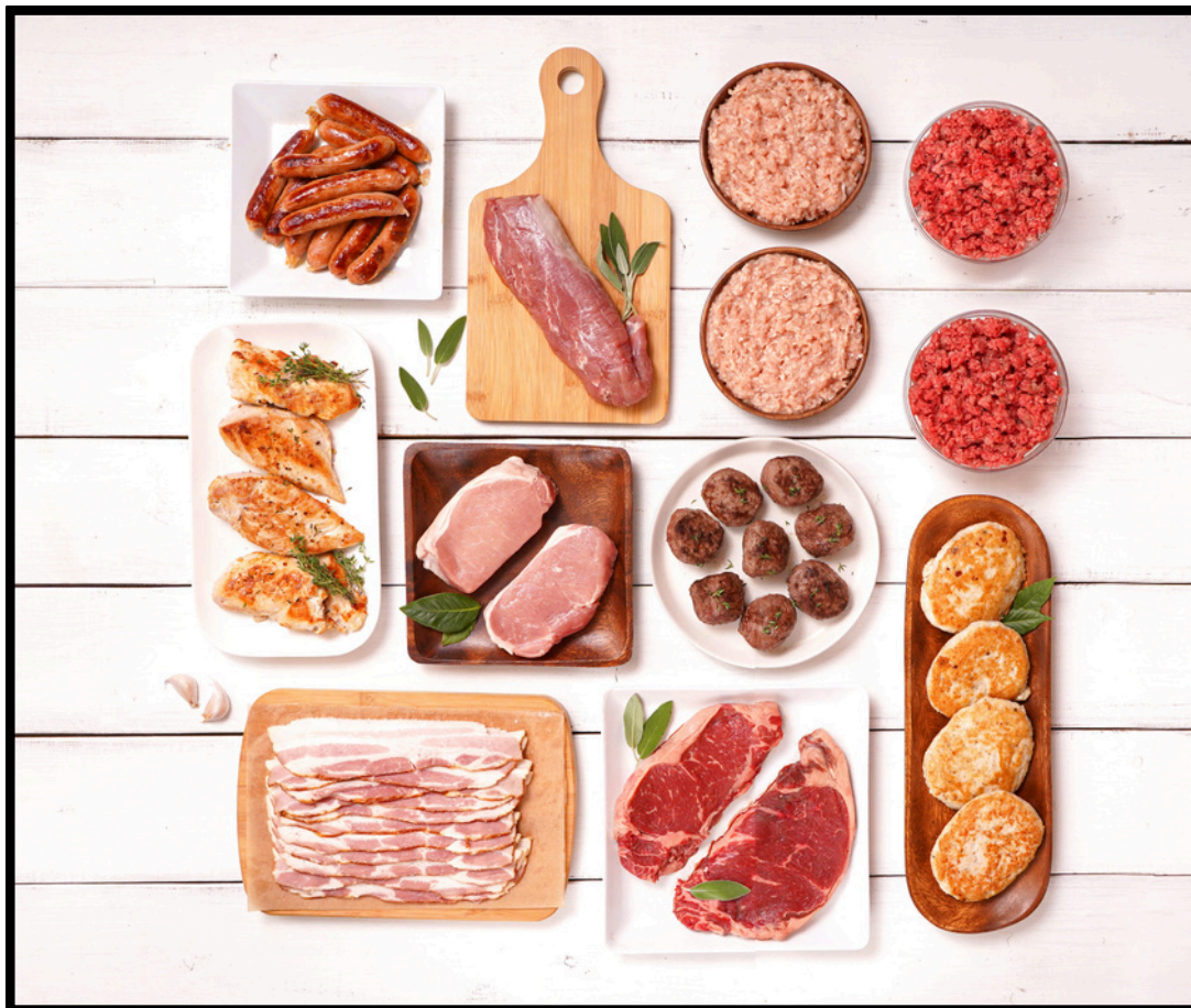
Mix It Up Box 3 different sizes available