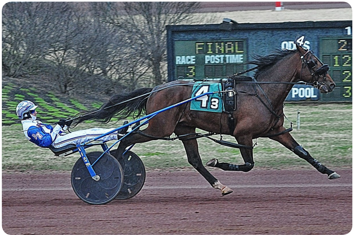
All Or Nothing has never tasted defeat in his one start and three qualifiers, winning all four by 27 combined lengths.

The last race on Saturday's program could prove contentious as well with Captaingiddyupngo, a well-bred son of Captaintreacherous, making his local debut following a third-place finish in a prep race on