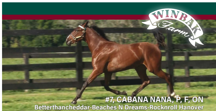
#7, CABANA NANA, P, F, ON

Betterthancheddar-Beaches N Dreams-Rocknroll Hanover