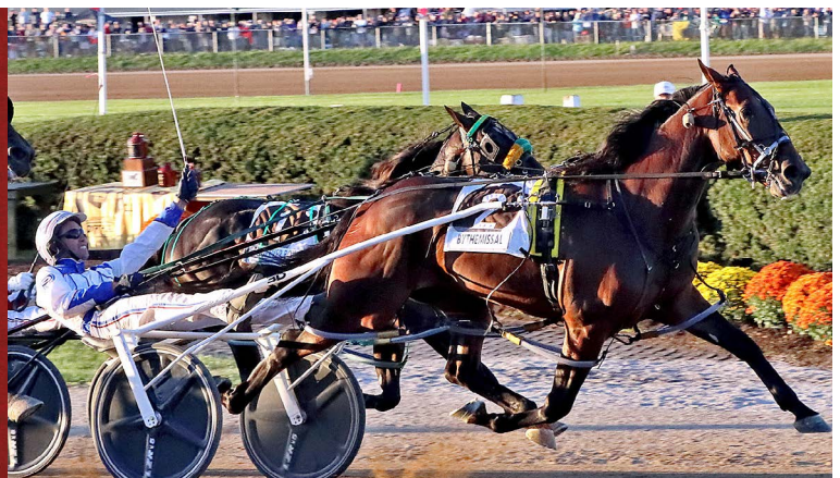
2022 LITTLE BROWN JUG CHAMPION - Bythemissal