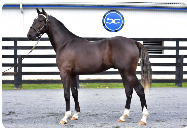
BLUE CHIP FARMS

HIP number 49 Ima Perfect Choice could be the perfect blend of New York Sire Stakes-line pedigrees, being a colt out of an American Ideal-sired mare. Perfect Choice is just the second foal from Ideal Paper, with the mare a 100 percent producer.