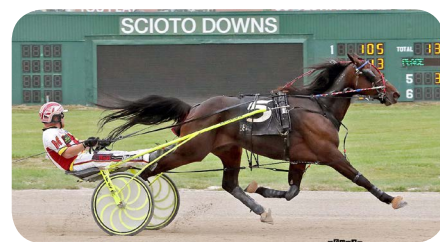
Kildare King has been on the board 25 times in his previous 31 starts.

Racing begins at 5 p.m. (EDT) Saturday at Scioto Downs. The Hill and Ewart are races 13 and 14, respectively, on the 18-race card.