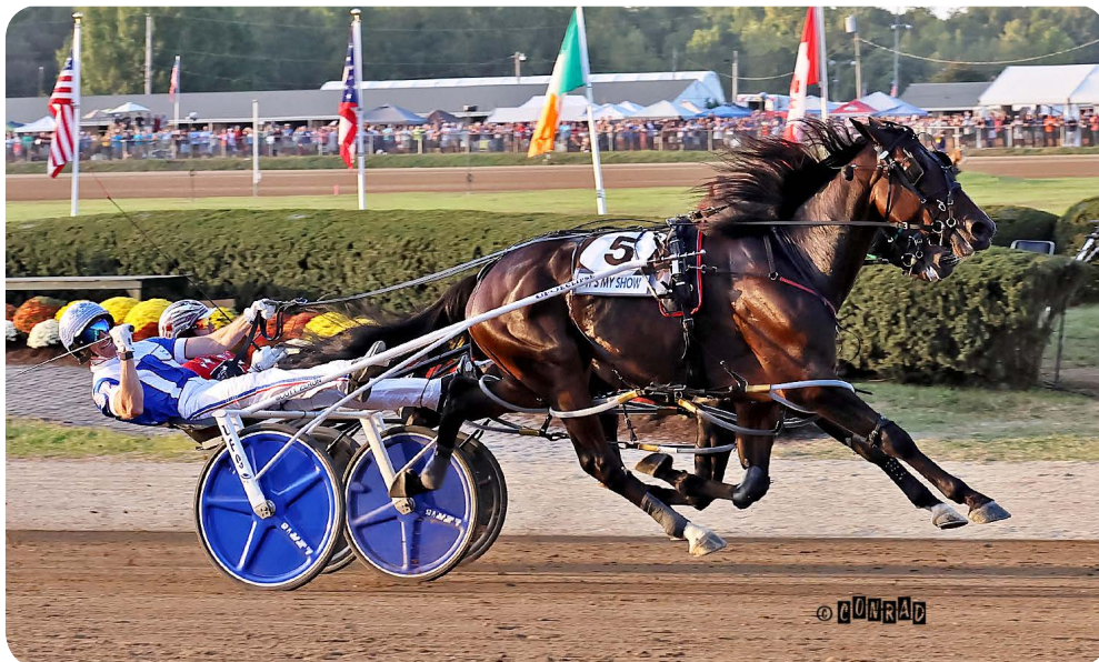
It's My Show got past Seven Colors steps before the wire at the Delaware County Fairgrounds.

"I've been waiting and waiting to change his bridle," she explained.