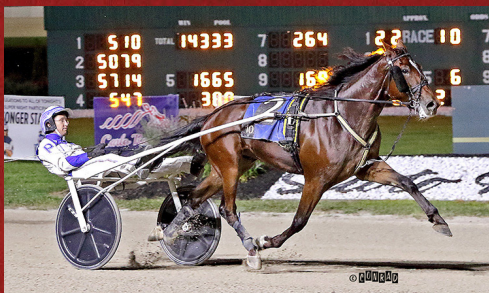
TENNESSEE TOM 2-Year-Old Colt Trotting Champion