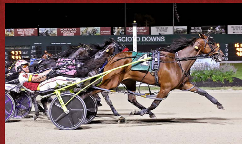
TARAPASTA 3-Year-Old Filly Pacing Champion