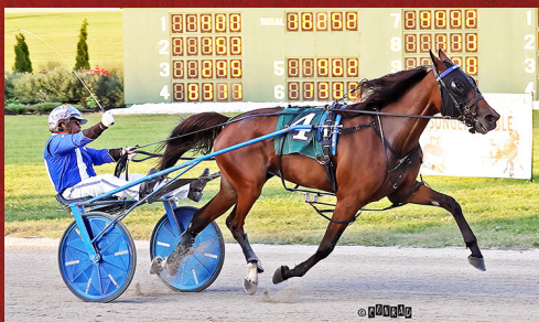
SUGAR INSTEAD 2-Year-Old Filly Trotting Champion