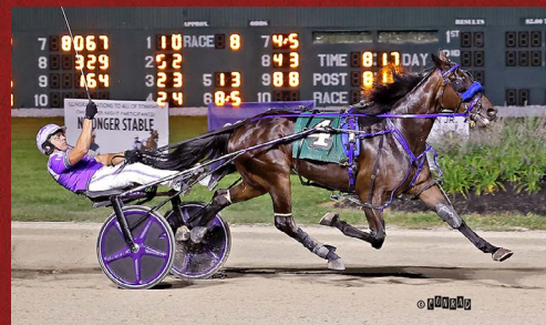
GRAND REVIVAL 3-Year-Old Colt Trotting Champion