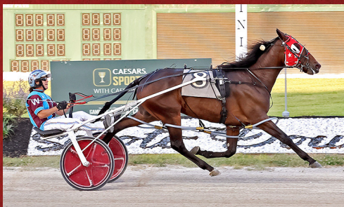
DAISY'S STAR 2-Year-Old Filly Pacing Champion