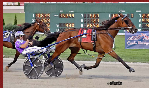
ROSE RUN YOLANDA 3-Year-Old Filly Trotting Champion