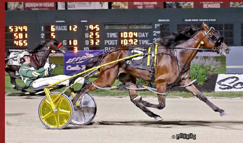
WICKED CHARACTER 3-Year-Old Colt Pacing Champion