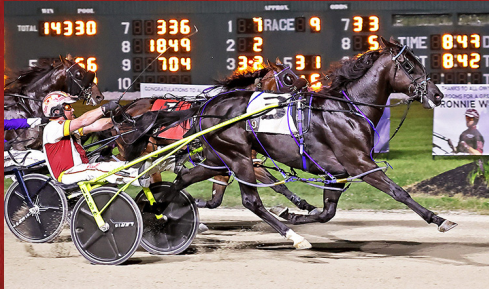
CLEVER CODY 2-Year-Old Colt Pacing Champion