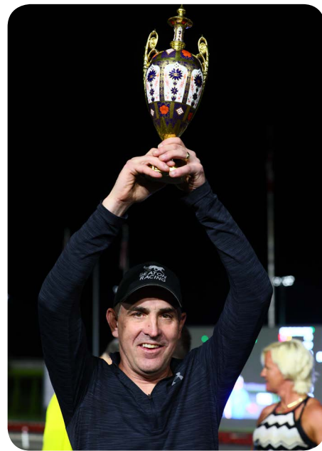
NEW IMAGE MEDIA

"I told Casie [Coleman], 'if you don't mess these horses up we'll be in the North America Cup winner's circle'"