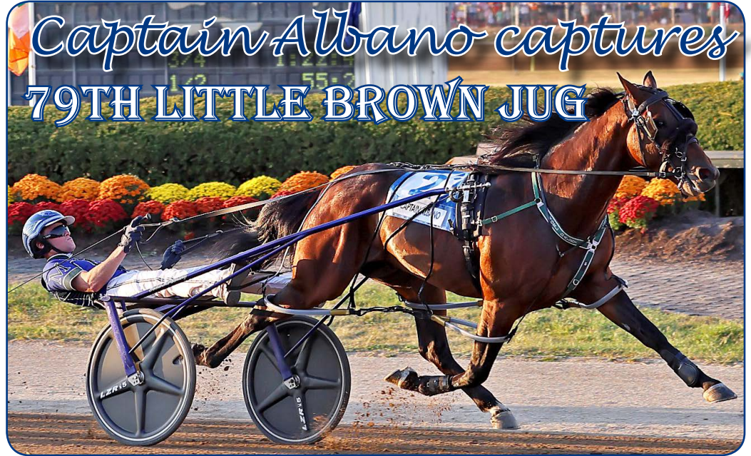
Captain Albano won his elimination and final of the Little Brown Jug on Thursday.