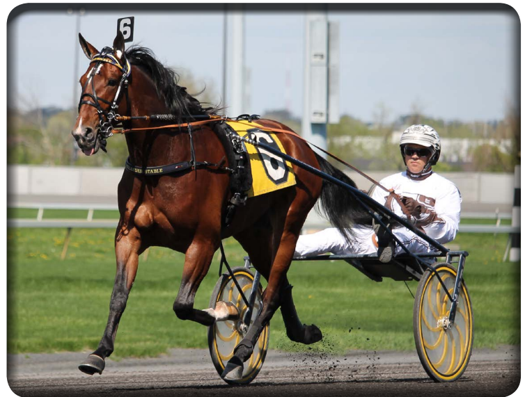
Bettor's Wish (above) and Gimpanzee (below) both returned to race as 4-year-olds.

value could he add by racing? Not much."