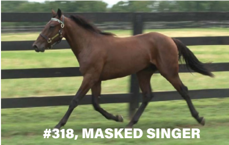
#318, MASKED SINGER