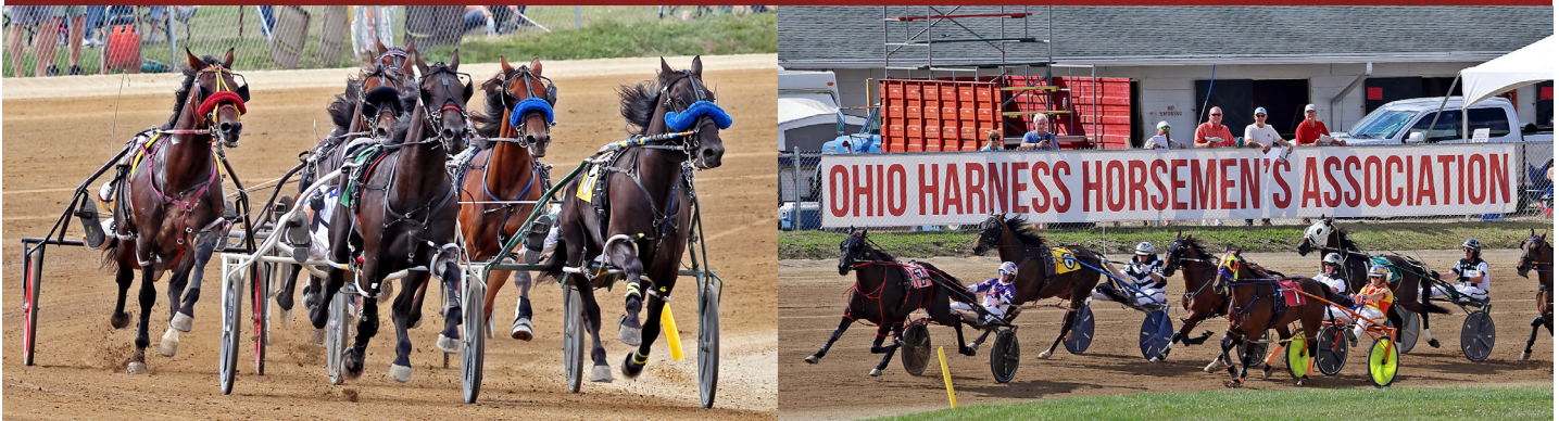
Bythemissal - 2023 Breeders Crown Open Pace Champion

Every Standardbred Racehorse Has a Place in Ohio: BREED • BUY • RACE • WIN IN OHIO