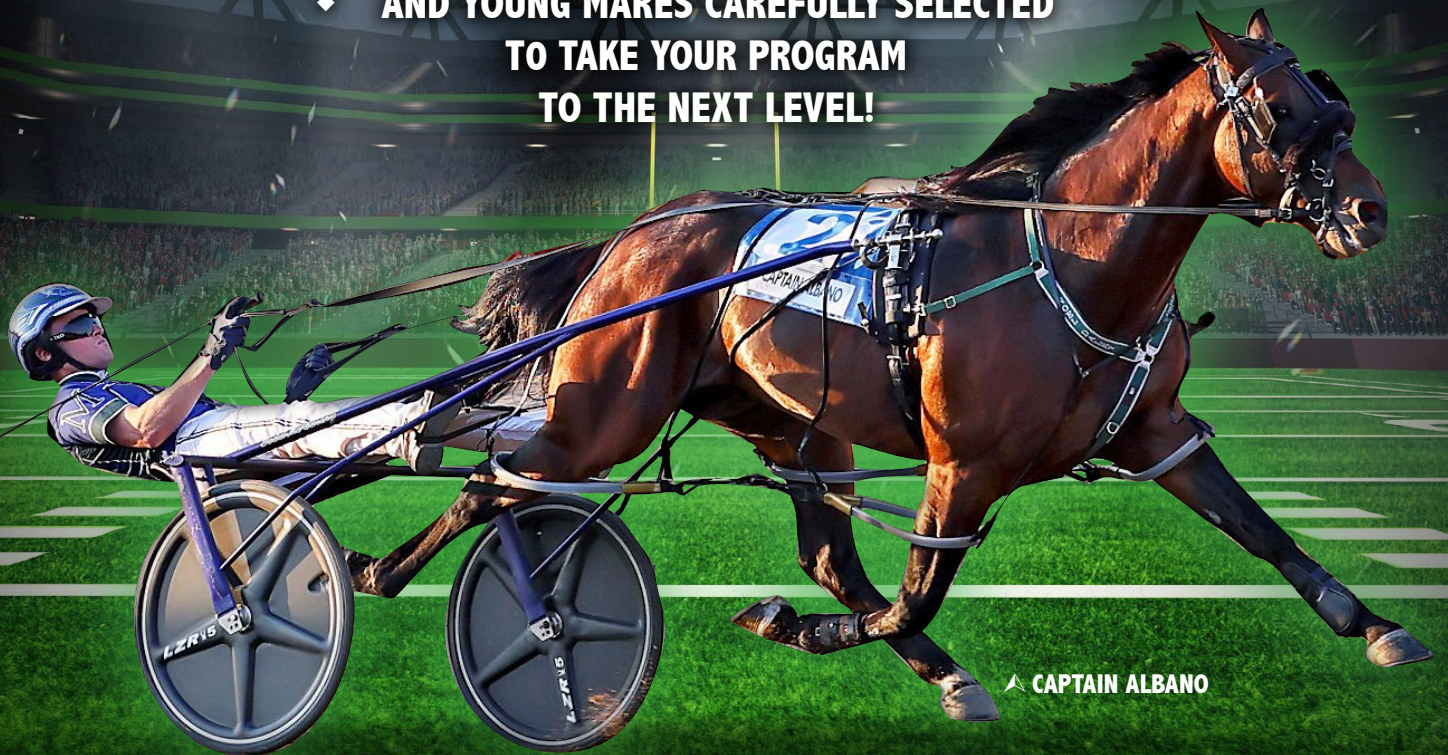
▲ CAPTAIN ALBANO

ALL AMERICAN HARNESSBREDS PHASE I DISPERSAL SELLING AT THE STANDARD BRED MIXED SALE NOVEMBER 7, 2024