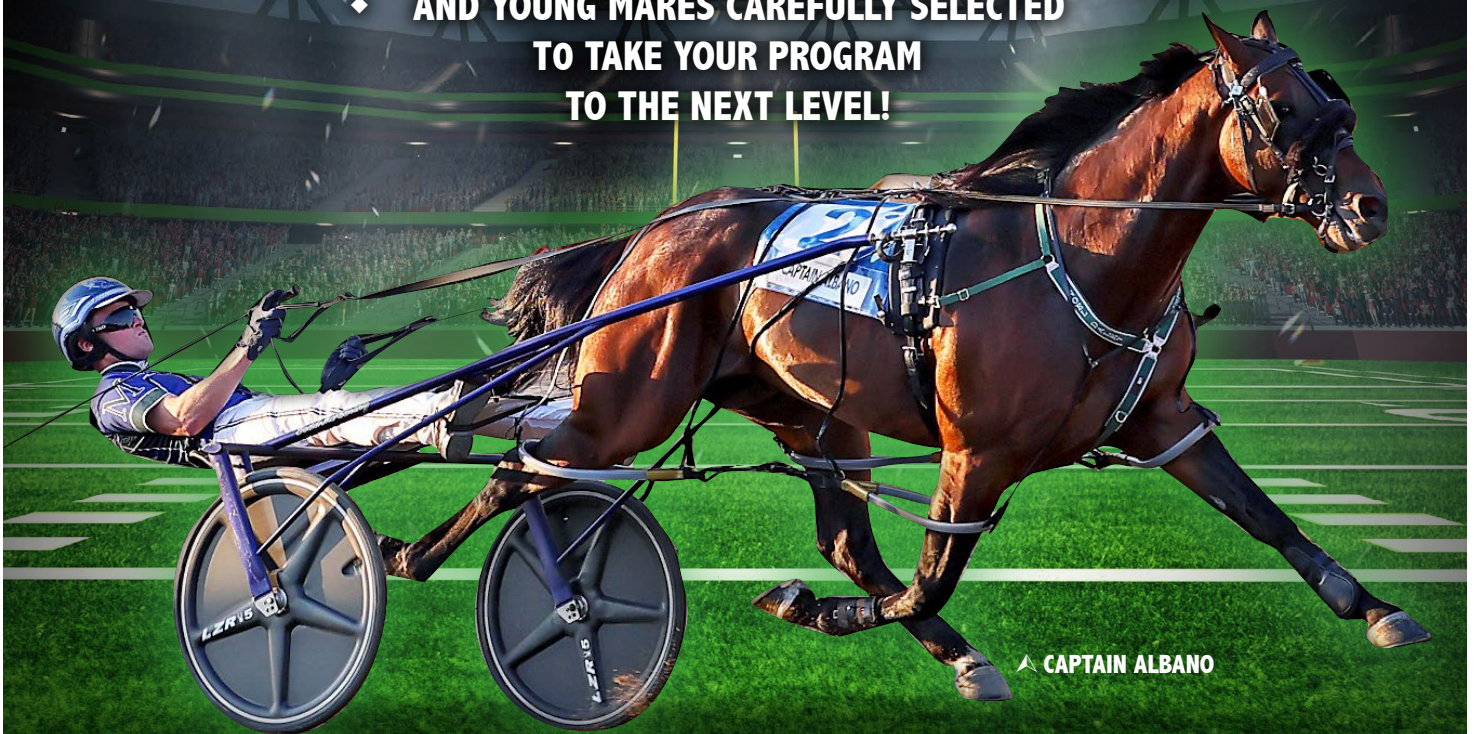
▲ CAPTAIN ALBANO

ALL AMERICAN HARNESSBREDS PHASE I DISPERSAL SELLING AT THE STANDARDBRED MIXED SALE NOVEMBER 7, 2024