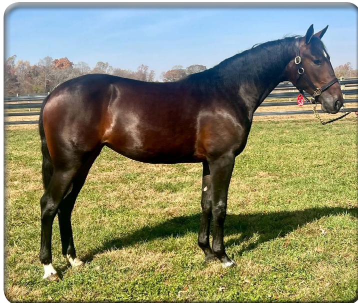
CONCORD STUD FARM