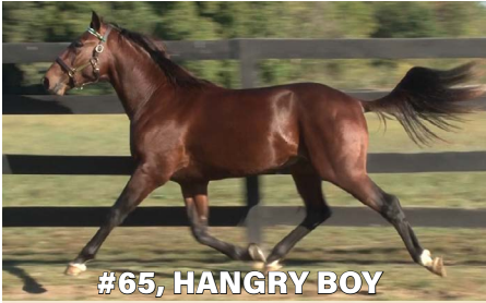
#65, HANGRY BOY