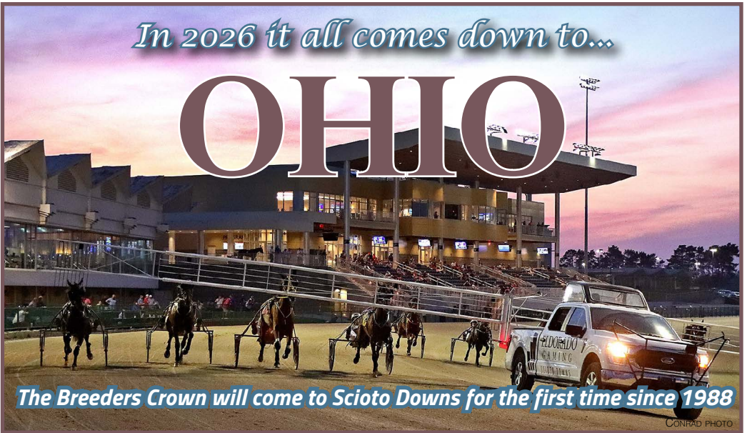
The Breeders Crown will come to Scioto Downs for the first time since 1988