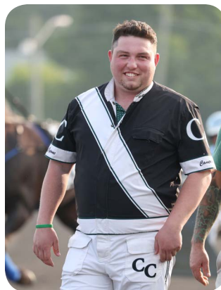
NEW IMAGE MEDIA PHOTOS