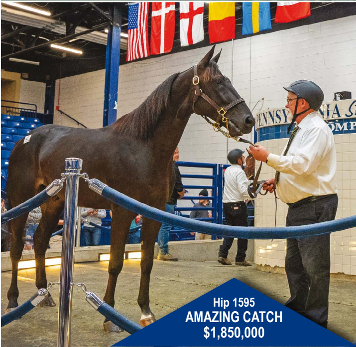
Hip 1595 AMAZING CATCH $1,850,000

The 2024 Harrisburg Mixed sale set a new gross sales record of $31,608,000 and an all-time average record of $52,945 from the two-day auction of broodmares, racehorses, weanlings, yearlings & stallion shares!