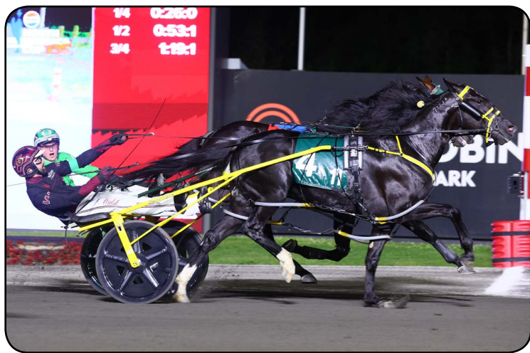
Louprint (4) refused to lose to Madden Oaks in the North America Cup at Woodbine Mohawk Park in June.

The unquestioned leader of the 3-year-old male pacing ranks after his victory in the $740,000 North America Cup at Woodbine Mohawk Park on June 14, Louprint had qualified on July 4 ahead of the Meadowlands Pace the following Saturday. Unfortunately an emergency procedure was required to remove one of his testicles and he was never able to compete in the $656,000 race.