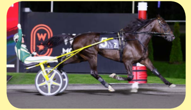
NEW IMAGE MEDIA

Canada's fastest trotter Lexus Kody and multi-millionaire Periculum have been named the final two horses for the $1,000,000 MGM Yonkers International Trot. The pair now complete a 10-horse field that will compete on September 13 at MGM Yonkers Raceway in the 1-1/4 mile classic.