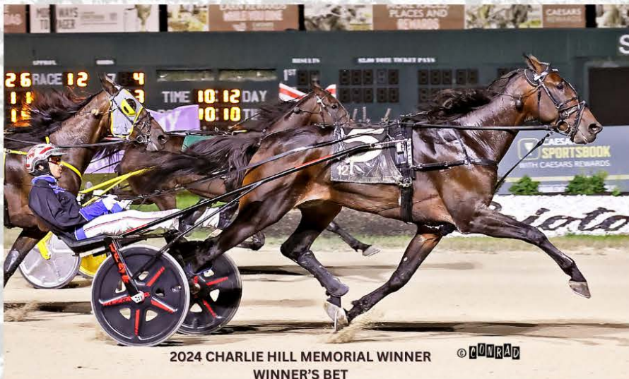
2024 CHARLIE HILL MEMORIAL WINNER WINNER'S BET

2 YEAR OLD COLT PACE 2 YEAR OLD FILLY PACE 3 YEAR OLD COLT TROT 3 YEAR OLD FILLY PACE 3 YEAR OLD FILLY TROT