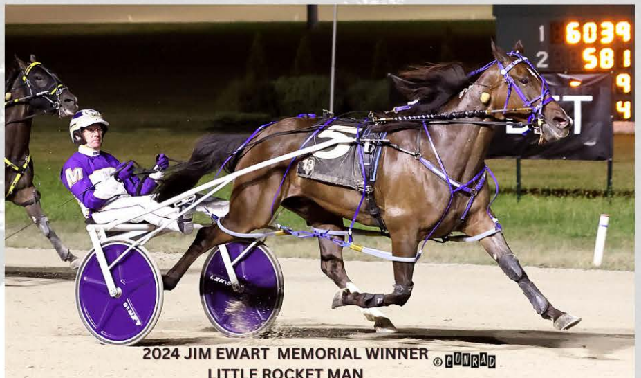
2024 JIM EWART MEMORIAL WINNER LITTLE ROCKET MAN