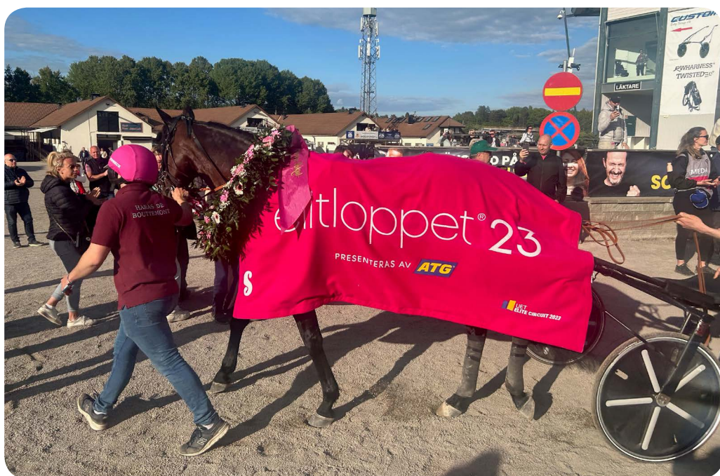
Hohneck won the 2023 Elitlopp at Solvalla in Sweden.

Racing begins at 12:20 p.m. (EDT) Saturday at MGM Yonkers Raceway. The MGM Yonkers International Trot is race six on the card, between the $200,000 Grade 2 Aria Invitational Pace (race five) and $200,000 Grade 2 Bob Miecuna Invitational Trot (race seven). Post time for the MGM Yonkers Invitational Trot will be approximately 3 p.m. and the race will be shown on FS2 as part of America's Day at the Races.