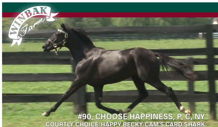
#90, CHOOSE HAPPINESS, P, C, NY COURTLY CHOICE-HAPPY BECKY-CAM'S CARD SHARK

Bottom line, there is plenty to choose from at nearly any price point from $10,000 on up. I will be at the sale, so say hello. I hope you cash... on a future champion. See you next time.