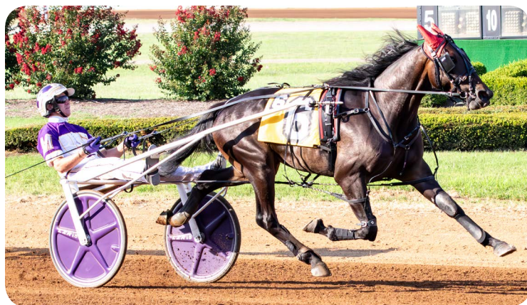
Endurance (above) and Silverstein (below) are two of the starters in Saturday's Mohawk Million.

potentially winning the Mohawk Million would help advance the horse's future once his racing career was done.