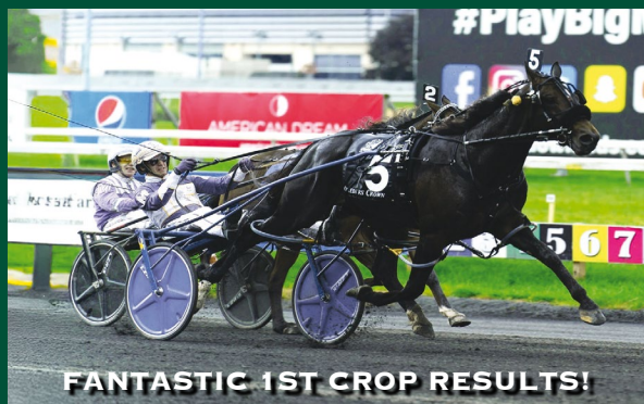
FANTASTIC 1ST CROP RESULTS!

(Always B Miki - Shebestingin - Bettors Delight) p,2,1:49.2; 3,1:48.1 ($1,861,447)