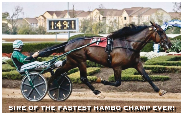
SIRE OF THE FASTEST HAMBO CHAMP EVER!

(Muscle Mass - Pleasing Lady - Cantab Hall) 3,1:49.1 ($1,973,661)