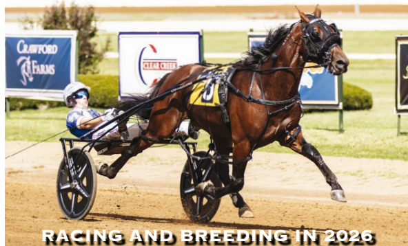
RACING AND BREEDING IN 2026

(Captaintreacherous - Cinamony - Art Official) p,2,1:49; 3,1:48 -'25 ($1,573,723)