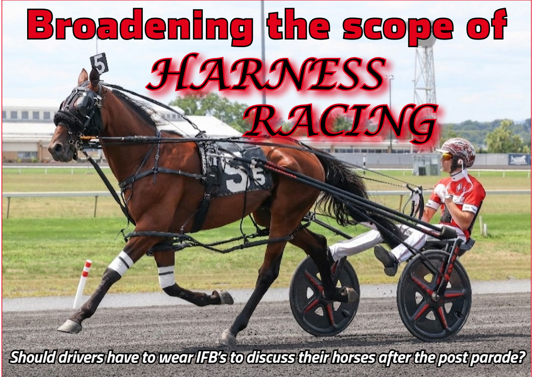
Should drivers have to wear IFB's to discuss their horses after the post parade?