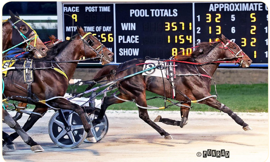
Surreal Ideal likes to win races by less than a length.