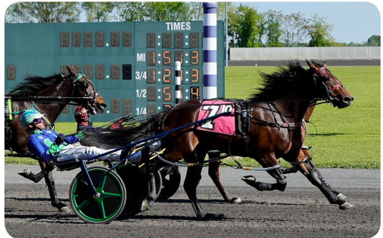
Miss Jum Jabber defeated recent Fan Hanover winner Loua Dipa in an early May PA Sire Stakes event at Harrah's Philadelphia.