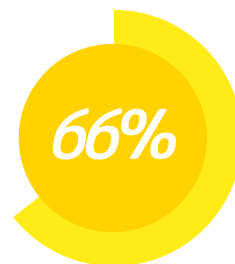
of B2B customers stop buying after a bad interaction*

Whether a customer believes they had a good experience or not can actually have a significant impact on sales.