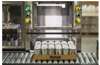
CASE/BOX FORMING & SEALING

It's time to pack some beer for your outgoing orders. Depending on if the beer is in bottles or cans, it will need to be packed in cases or trays. However, those cases and trays are likely purchased as a stack of flat cardboard that still needs to be formed. Wexxar Bel offers solutions that help with just that. For the craft brewers that are expanding into further distribution opportunities but wanting to minimize the accompanying manual labor time, Wexxar Bel provides semi-automatic and fully automatic, case/tray formers and sealers. These machines accommodate a range of production volumes from low to high-speed, all built to make the bottle or can bundling process easier and faster.