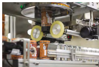
SHRINK SLEEVE APPLICATOR

Craft beer production can vary from smaller seasonal to high quantity, and with this comes the need for an economical solution for labeling different can quantities. Axon's shrink sleeve applicators provide a simple, flexible alternative to directly printing on cans. It doesn't matter if you are just starting out or looking to expand your production, Axon has a shrink sleeve applicator that's right for you.