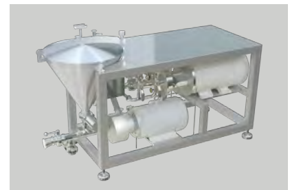
BLENDING/MIXING PROCESS UNIT

At the heart of all good beers and seltzers is a proven recipe and the use of quality ingredients. Following close behind is the build out of a reliable production system that allows you to achieve process consistency at increasing volumes. That's where Statco-DSI's beverage processing solutions come in. They offer everything from complete systems in cold processing to modular process units like mixers and blenders. Their technologies deliver accurate mass transfer ratio when injecting carbonation or nitrogenation. They also add the flavors and ingredients such as hops, controlling for even distribution and dissolution. Additionally, Statco-DSI offers a unique system for craft brewers known as the Hopsys that supports dry hopping. It incorporates the unique process of introducing the hop pellet directly into the beer stream under the liquid level, which helps assure consistent wetting and minimal dissolved oxygen pickup—resulting in an overall better end-product for your customers.