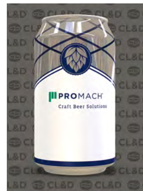
SHRINK SLEEVE PRODUCTION

Full 360-degree decorative labeling coverage is achievable with shrink sleeves, and CL&D offers many options to ensure customers get the right fit and finish. Our unique special enhancements include matte or matte gloss finishes, metalized inks, pearlescent varnish, anti-counterfeit technology, color-shifting inks, and tactile coatings. CL&D Shrink films offer many versions of PET, PVC, OPS, and White Blackout. Additional advantages of using CL&D include: research and development support, reduced inventories, bundle packs and perforations/easy-tear, and fast lead times.