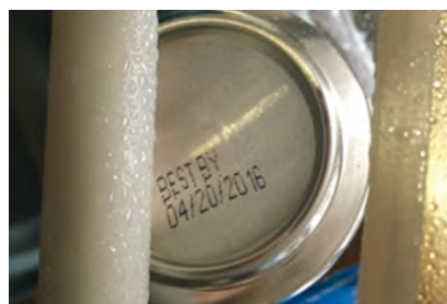
DATE AND BATCH CODING

Achieve high quality codes - every time - with ease of use and minimal maintenance intervention. ID Technology's Citronix continuous inkjet (CIJ) printers are the ideal solution for adding date codes to your bottles and cans. All Citronix CIJ printers feature IP55 washdown protection as standard and are built to perform in harsh environments. An alternative to printers and managing the consumable materials that go along with it, is the iCON Masca laser. Specifically designed for small character coding applications, this laser has a very competitive price point for the budget conscious brewer.