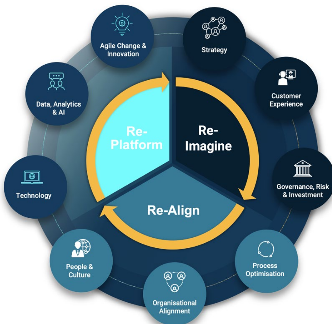
Overview of the 'Lighthouse Digital Transformation Framework'©

Our holistic approach, fusing strategic thinking with our technology strength and operating model expertise – as well as our empathetic change leadership style – empowers our clients to accelerate their digital transformation and positions them to keep transforming on ongoing basis.