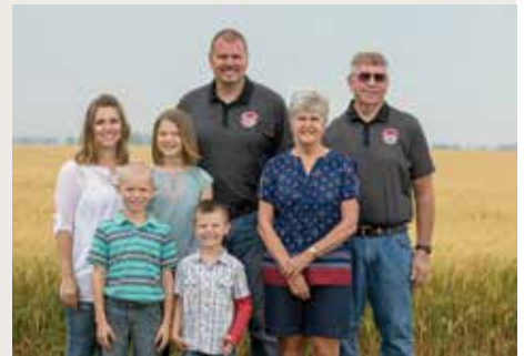
STATELER FAMILY FARMS