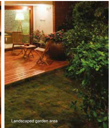
Landscaped garden area

The reference images showcase options for the specific products/finishes marked on the image.