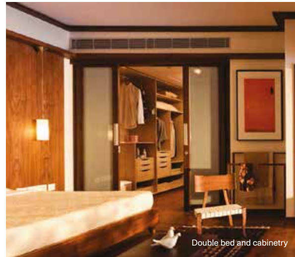
Double bed and cabinetry