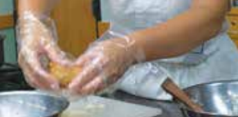
| Cooking Demo |