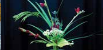
| Ikebana |