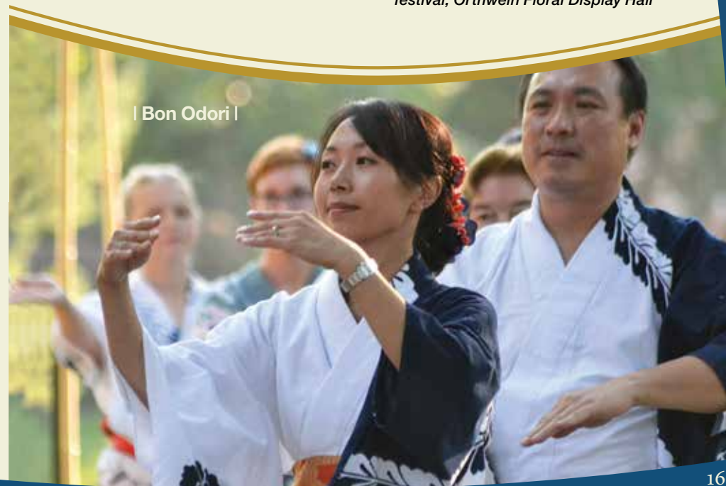
| Bon Odori |

Demonstrations all three days, 10 a.m.; Displayed throughout the festival, Orthwein Floral Display Hall