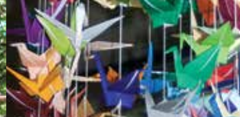
| Origami |