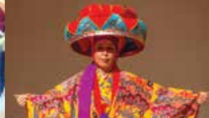
| Kimono Fashion Show |