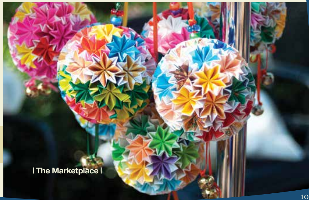
| The Marketplace |