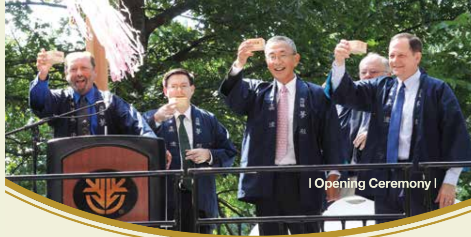
| Opening Ceremony |