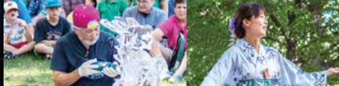
| Ice Sculpture |