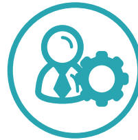
CONTROL, TRACKING & METRICS PROCESSES