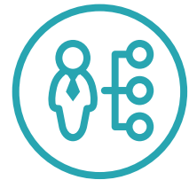
MANAGEMENT, LEADERSHIP & SUPPORT