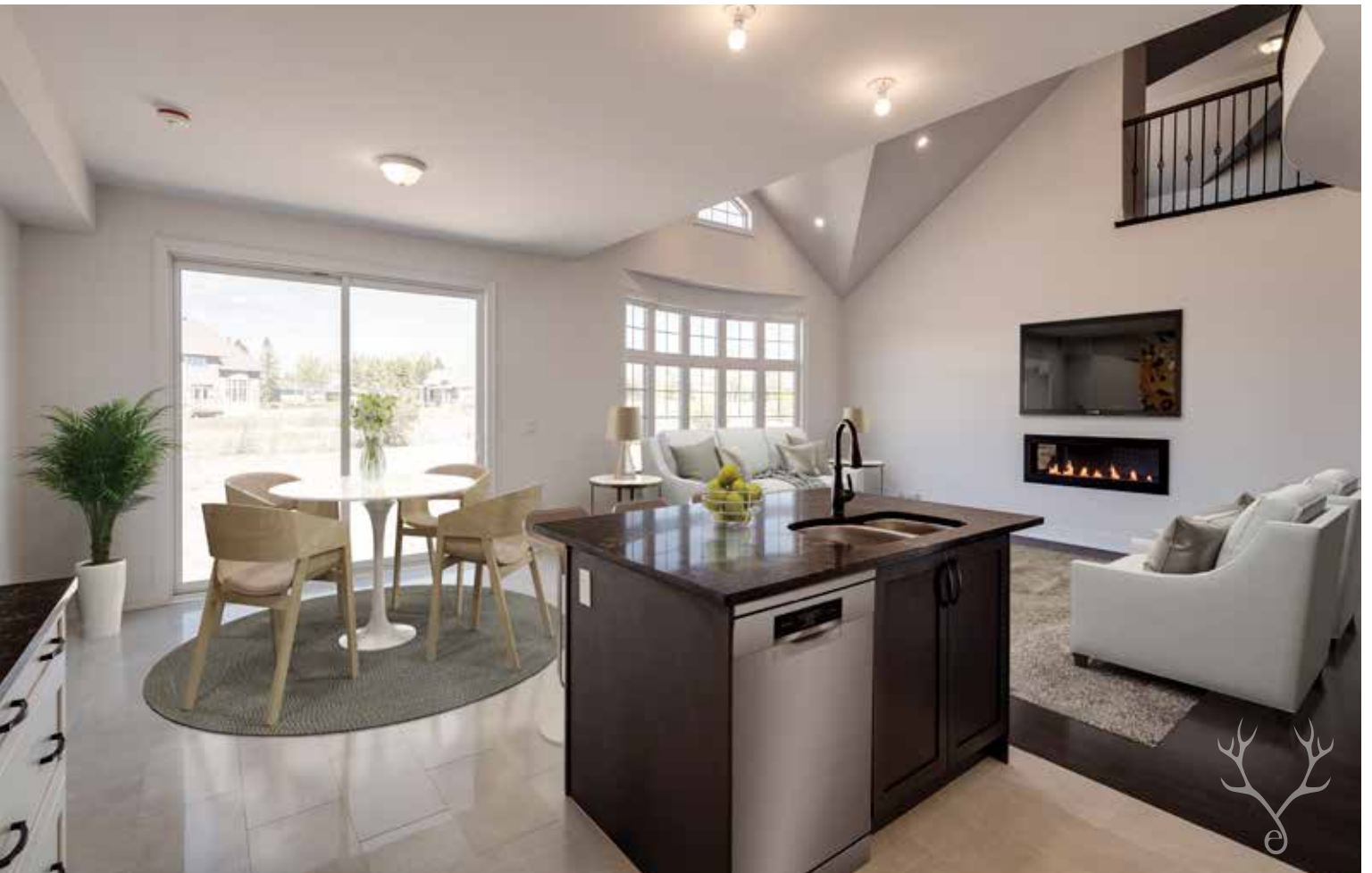
Photos above are virtually staged.