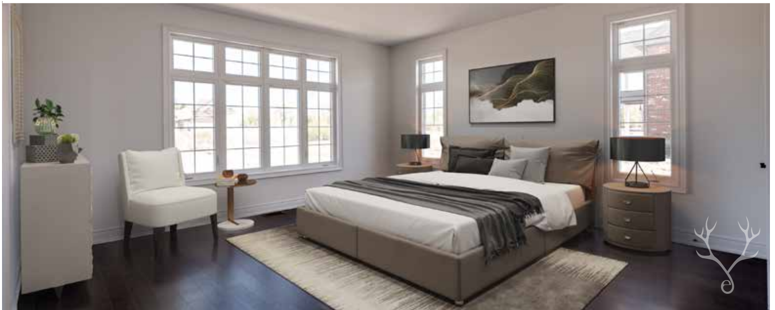
Photos above are virtually staged.