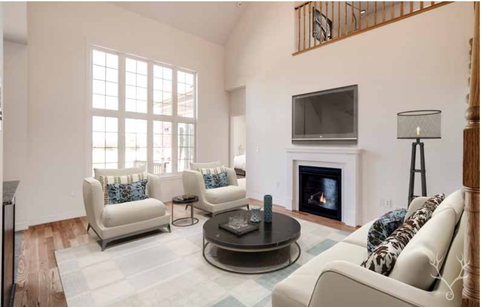
Photos above are virtually staged.