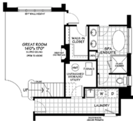
MAIN FLOOR LOFT CONDITION ELEV - A & B