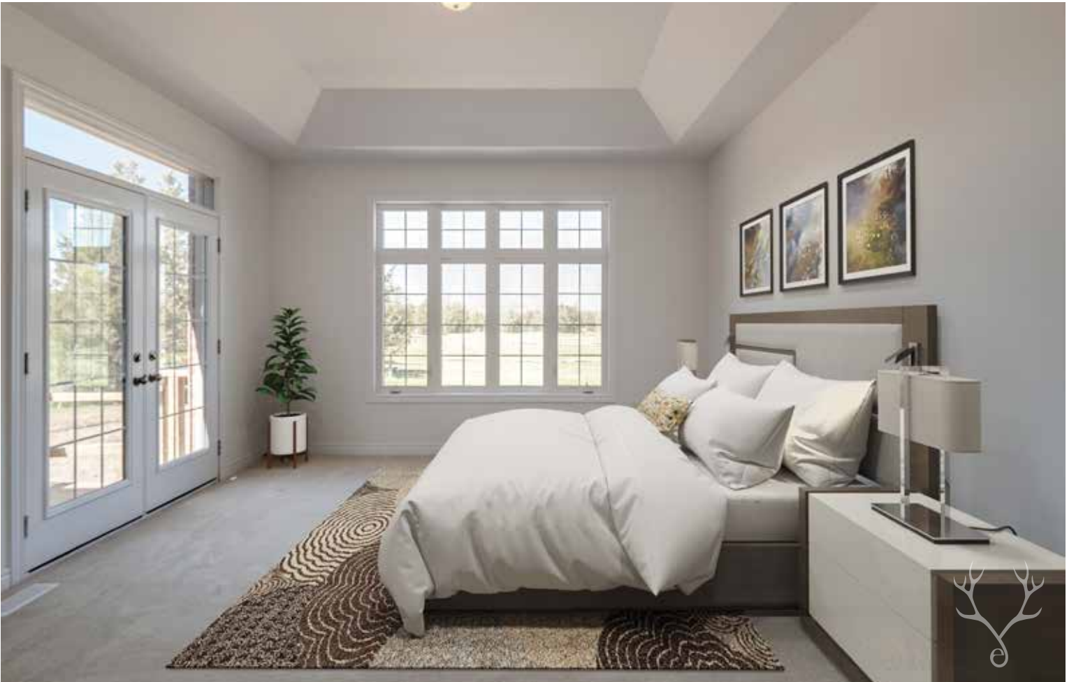
Photos above are virtually staged.