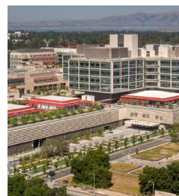
Stanford Health Care GHG Accounting