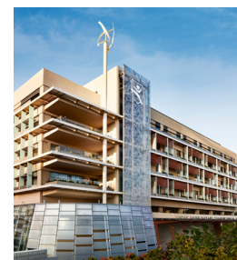
Lucile Packard Children's Hospital Carbon Neutrality Strategy