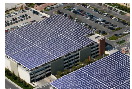
Kaiser Permanente National Energy Strategy