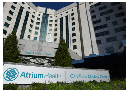
Atrium Health Energy Strategy