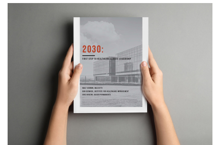
National Academy of Medicine scoping paper on decarbonizing healthcare in the U.S.