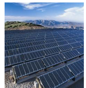
Kaiser Ontario Microgrid (CEC Grant-funded)