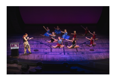
Teal Wicks (Wicked) and student performers