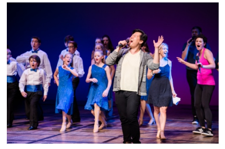
Kelvin Moon Loh (SpongeBob SquarePants) and student performers