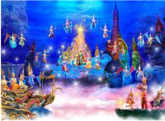
Siam Niramit Show

Upon arrival, meet your guide and join private transfer with guide from Bangkok Airport to hotel in Bangkok. Check in and free time at leisure in the evening.